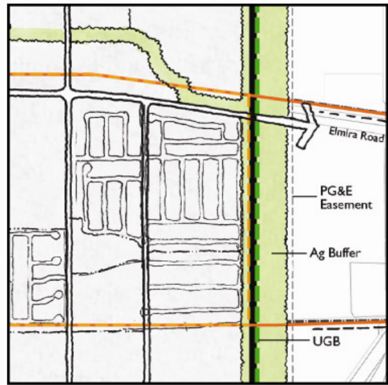
500-foot buffer, straddling the UGB but mostly outside the UGB.